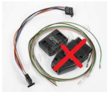
eSID 03-06 Lite

However, the remaining stock of components from eSID 03-06 Gen1 will be sold out as “eSID 03-06 Lite” to a reduced price and consists only of the eSID-HPD unit with modified software and no unit in the OBD-connector (eSID-GW).